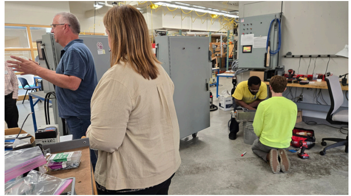
Tour of ICC manufacturing training center during ILDMC Quarterly meeting