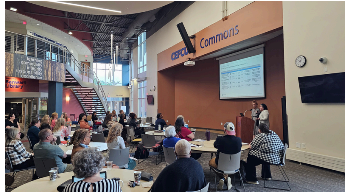
Newmark team at the relaunch of the RWA