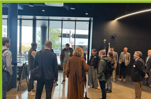
German startups during a tour of Distillery Labs

Greater Peoria continues to welcome international visitors, forging meaningful connections to strengthen our regional economy. Over the past year, we have hosted multiple groups, including two delegations from Brazil and visits from the consul generals of Mexico, Canada, Qatar and Australia. In October, eight German startups specializing in smart cities and sustainable mobility technologies explored opportunities in our region. Working closely with the German American Chamber of Commerce in Chicago, we arranged a “pitch” session for these visiting entrepreneurs. The attendees—local government staff, civil engineers, transportation experts, and other interested parties—learned about innovative solutions in urban planning and sustainable transport. Our international guests expressed genuine appreciation for our region’s hospitality and the vibrancy of Greater Peoria’s startup ecosystem. Introducing Peoria to those who might not otherwise discover it is one of the most rewarding parts of our work.