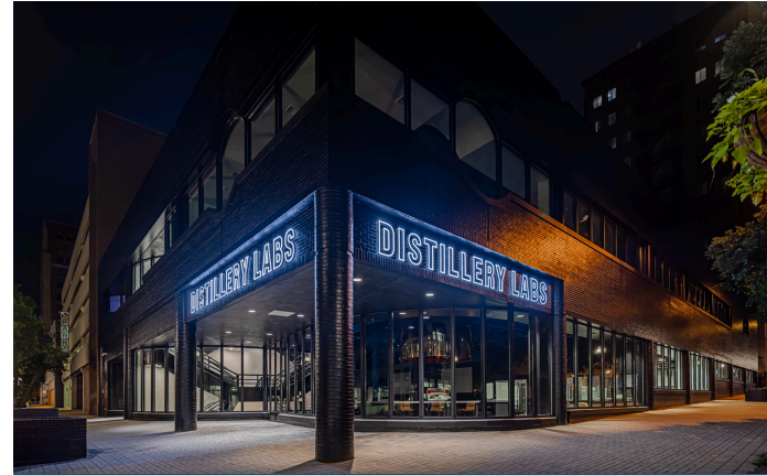
Distillery Labs building at night.

Since opening, Distillery Labs has hosted impactful events such as the Illinois Falling Walls Lab pitch competition, featuring local startups like HuMod, ShotHawk, and Rehab Ranger. It also welcomed the Illinois Innovation Network board meeting and the Startup Showcase, where nine graduates of the gBETA program made their first public pitches to a packed audience. Distillery Labs is also the new home of GPEDC which relocated in early August to serve as an anchor tenant and be better positioned to help the companies of tomorrow succeed.