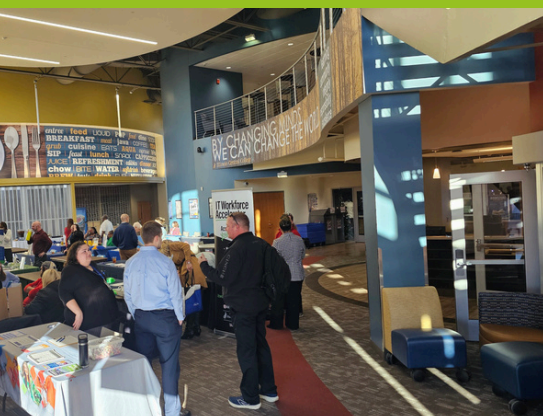
Participants at the Workforce Solutions Expo