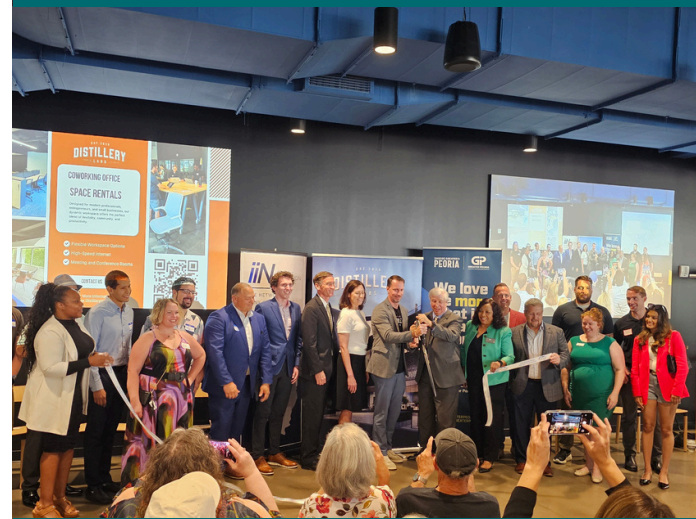
Proud Moment; Distillery Labs Ribbon Cutting Ceremony