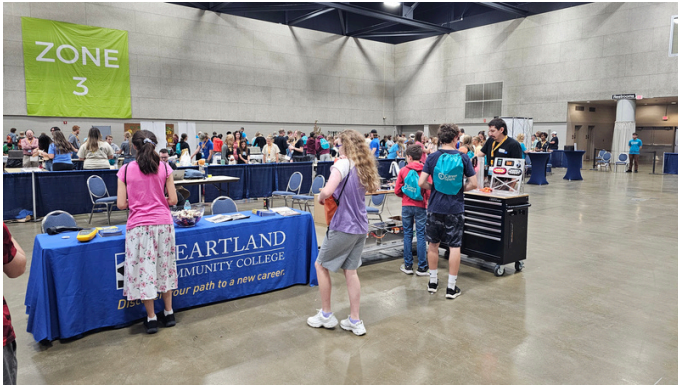
Students at exploring careers at CareerSpark

COMPANIES ON GREATER PEORIA REGIONAL JOB BOARD